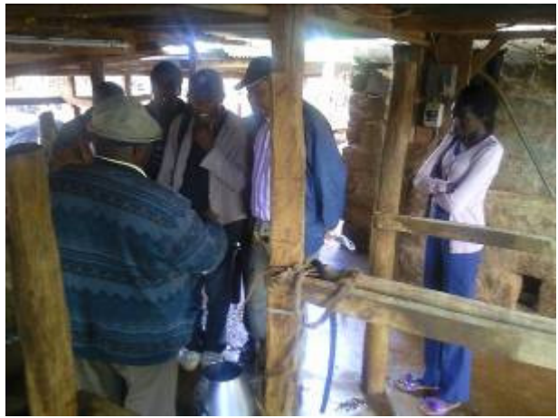
Photo: FACT Ltd, Kenya. Dairy farming training. Photo shows participants on a visit to our partner Este Farm, viewing milk processing, weighing and cooling;