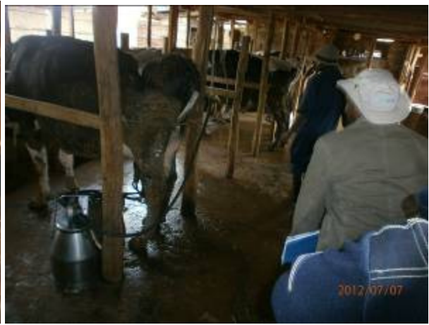
Photo: FACT Ltd, Kenya. Dairy farming training. Photo shows participants on a visit to our partner Este Farm. Left – viewing the cows lined in milking parlour at milking time. Right – viewing milking machine at work.