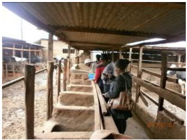
Photo: FACT Ltd, Kenya. Dairy farming training. Photo shows participants on a visit to our partner Este Farm, view of structures with host available to guide, explain and answer questions.