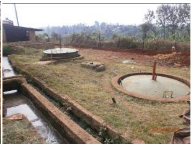
Photo: FACT Ltd, Kenya. Dairy farming training. Photo shows participants on a visit to our partner Este Farm, viewing waste management. Left – manure ready for the farm; Right – participants learn how to generate biogas from cow dung.