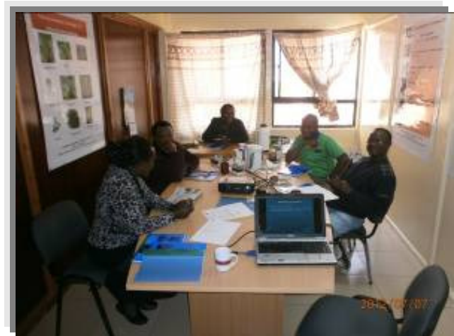
Dairy farming training class in July 2012. Well equipped boardroom style theory training rooms at our offices in Madonna House, Westlands, Nairobi. Theory session takes place from 9 am to 1pm.