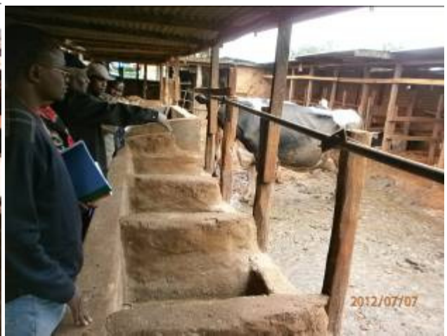
Dairy farming training. Photo shows participants on a visit to our partner Este Farm, viewing animals and their requirements at various stages of maturity.