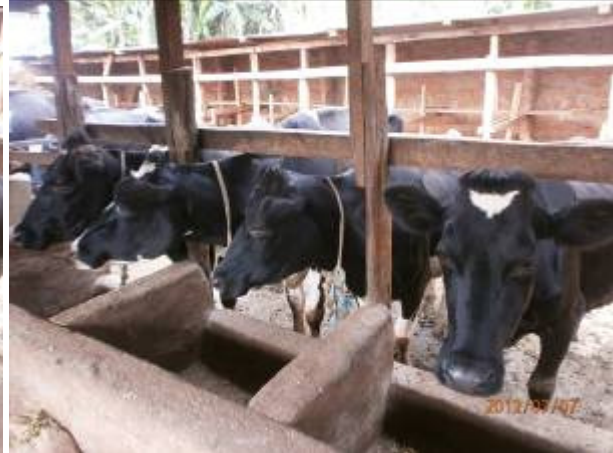
Dairy farming training. Photo shows beautiful animals at our training partner Este Farm. The animals are also curious about the visitors and follow them with an interesting gaze.