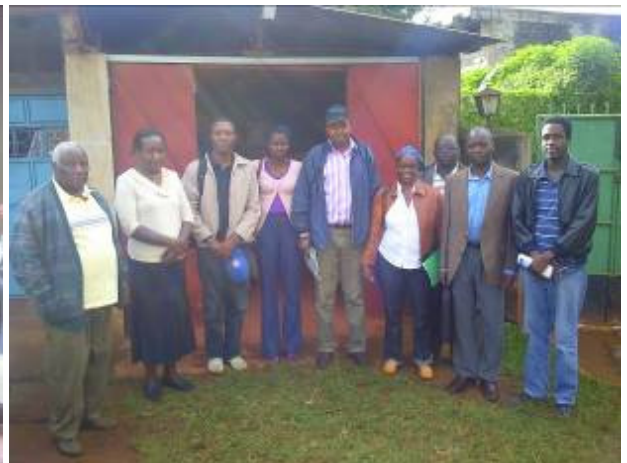
Dairy farming training. Photo shows participants hosted by owners at Este Farm.