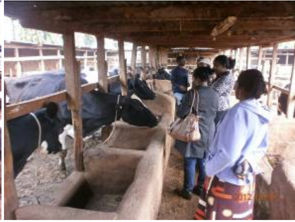
Dairy farming training. Photo shows participants on a visit to our partner Este Farm, viewing fodder preparation (left); and the various designs of the feeding points (right).